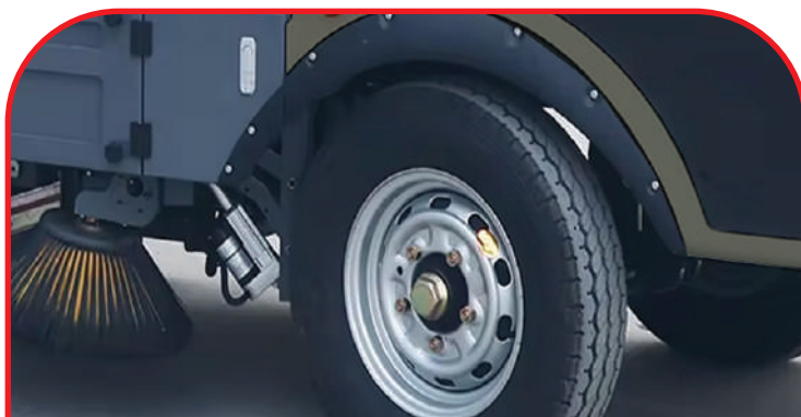
Durable Rubber Tyres