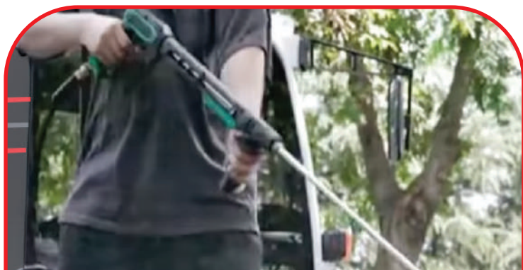
High Pressure Water Gun

From precision brushing to high-power vacuuming – every detail of DTMS-1000 EV is built for next-level street cleaning.