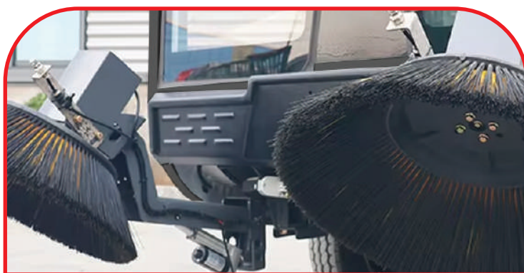
High Density Edge Brush