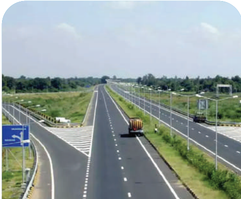
Roads & Highways

The DRS-600DT battery-operated sweeper is designed for heavy-duty cleaning in various public and industrial spaces. It ensures efficient dust and debris removal, making it ideal for: