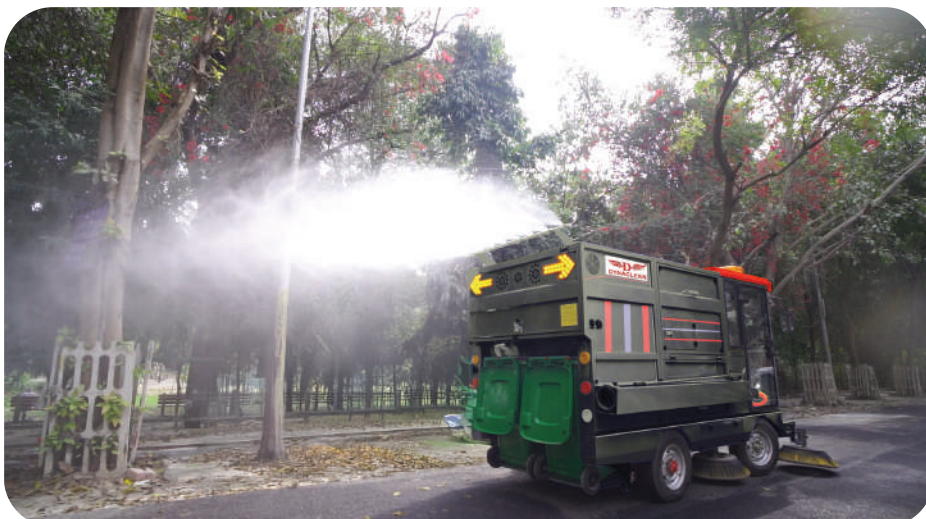
Anti Smoke Spray