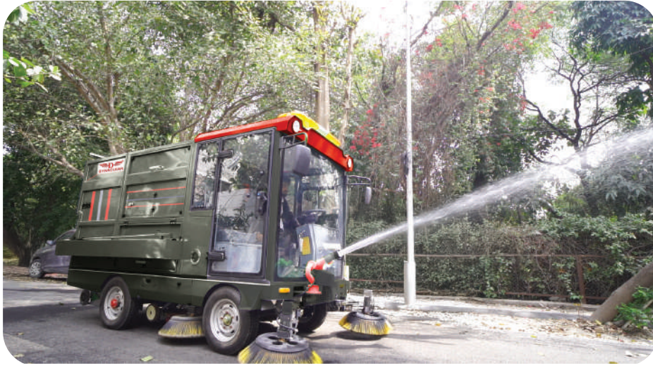
Plant Washing System

Advanced Sweeping, Water Spraying, and Dust Suppression – Ensuring Cleaner, Healthier, and Eco-Friendly Public Spaces.