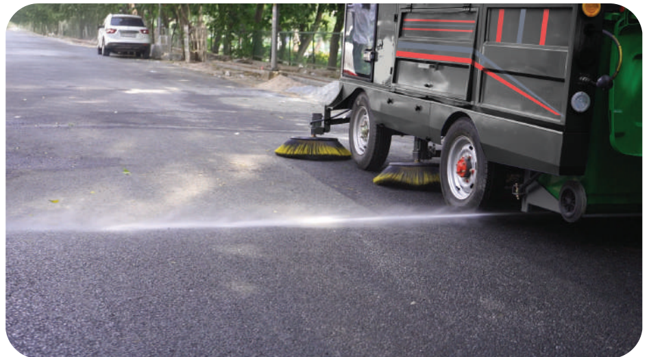
Jet Pressure Washer