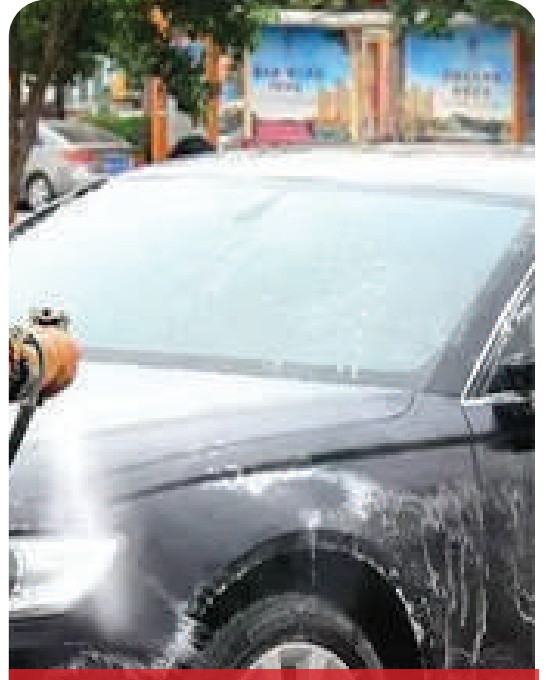
Household car washing