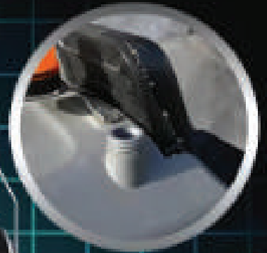
Water tank inlet