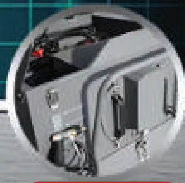
Anti Smoke Spray Water