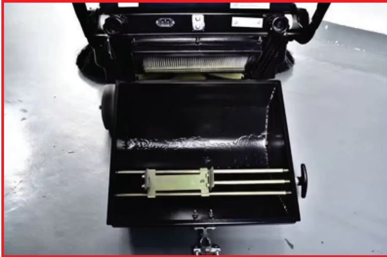
Side Brush Quality guaranteed to last